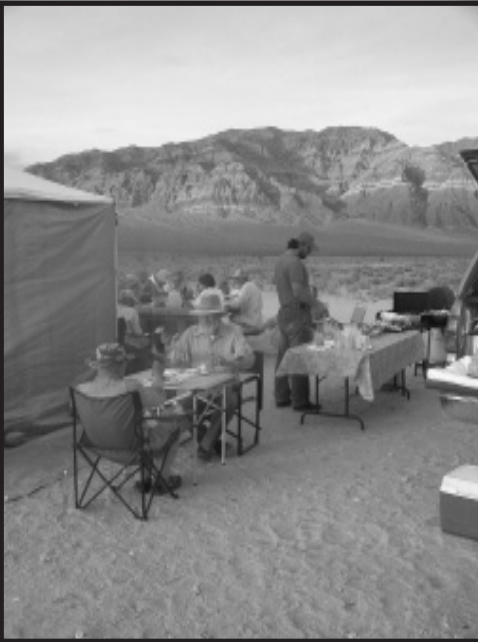
Eureka Dunes provides nice ambience for dinner